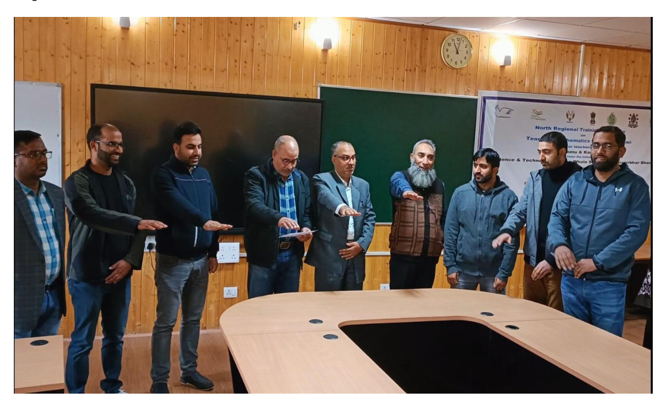
Department of Humanities, Social Sciences, and Management (HSS&M)