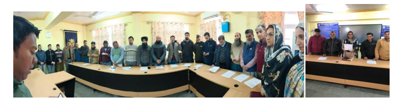
Electrical Engineering Department