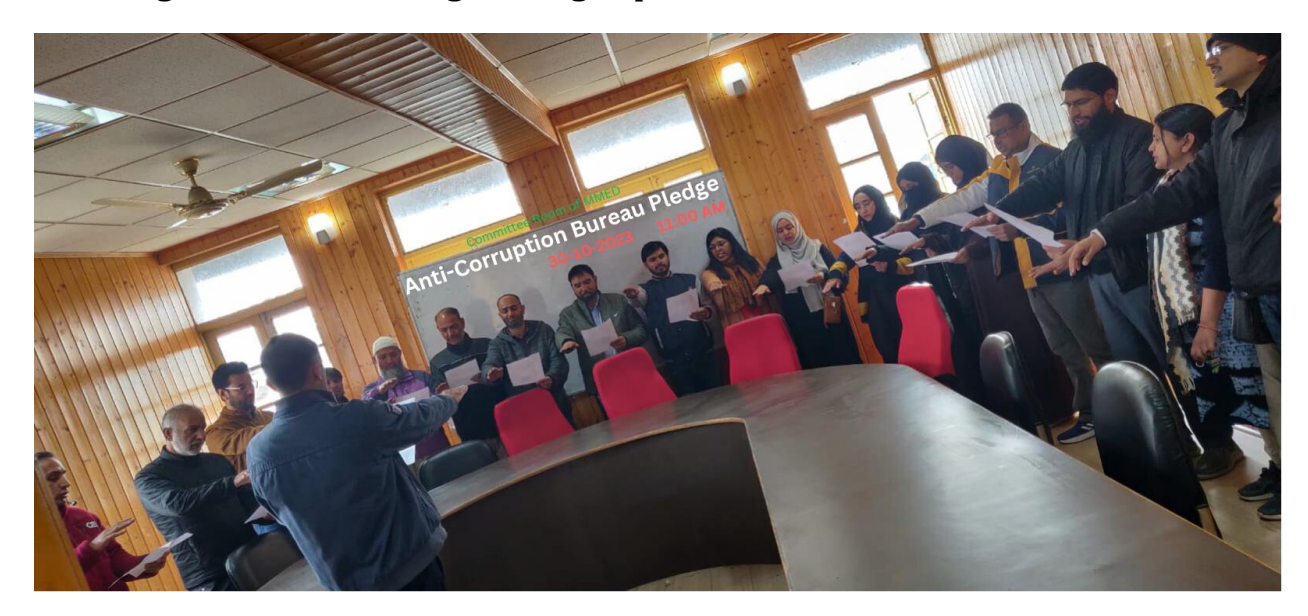
Department of Physical Education