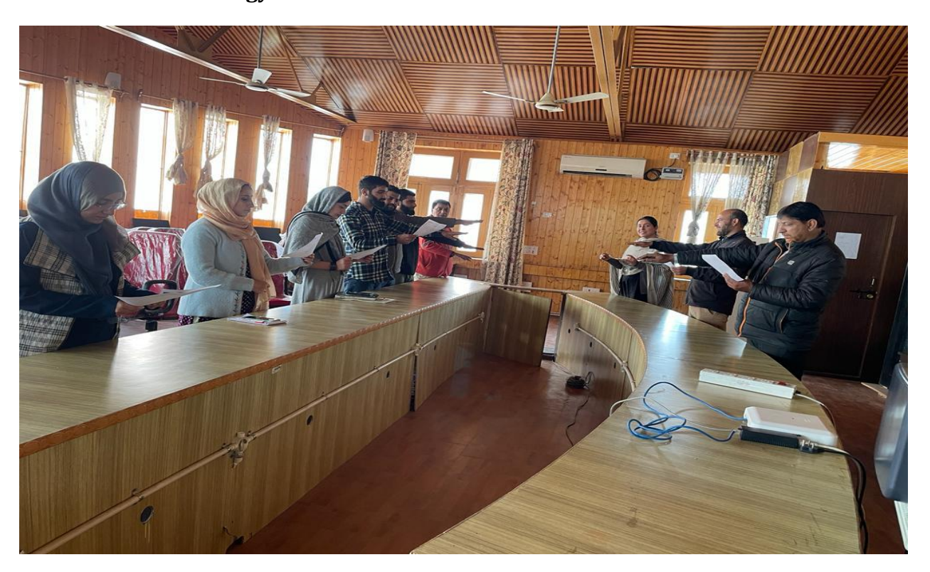
Chemical Engineering Department